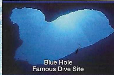
Blue Hole Famous Dive Site