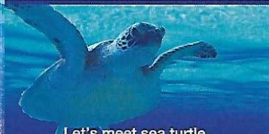
Let's meet sea turtle.

*The shop prepares rental equipment for course A - D participant who doesn't have own equipment. BCD, regulator, wet suit, fins and mask is $8 each. Total rental package is $40.