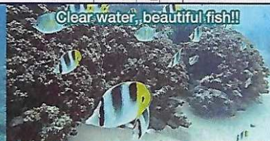
Clear water, beautiful fish!!

You don't need to worry, even with no prior experience! Boat dive plan is the best for more opportunity to explore the beautiful ocean!!