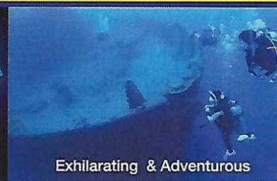
Exhilarating & Adventurous