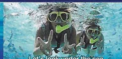
Let's look under the sea.

More than 90% possibility, you will meet sea turtle. Even if you're leaving Guam in the afternoon, you can participate in the morning course.